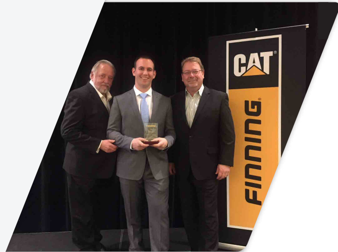
VMAC accepting FINNING International Inc's 2017 Innovative Partner award.