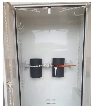
Gas Bottle Retainer