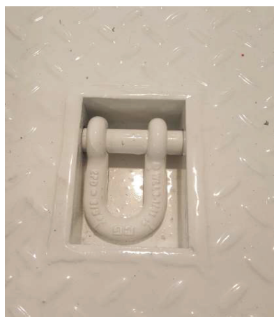
Cargo Tie Downs