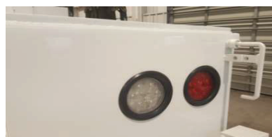
Recessed LED Lights